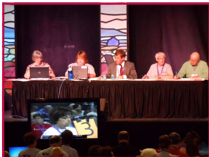
3 Conferences of Lay Members and Clergy voting