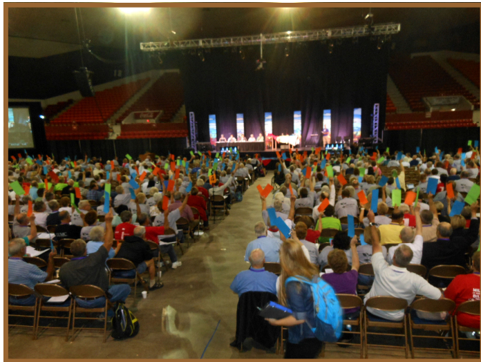
At the Uniting Conference 8/22-23/13

http://www.greatplainsumc.org/news/detail/150